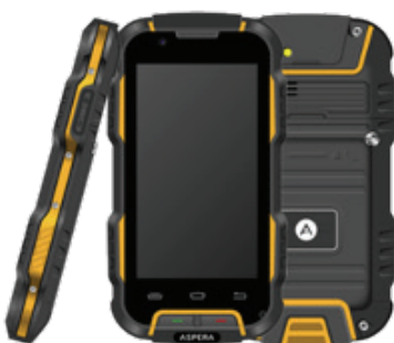
Just in Case Aspera R5 Ruggedised

Please Note: Devices only work alongside Oysta Platform.